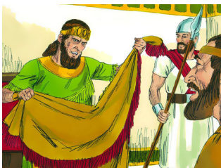
King of Israel

6 And he brought the letter to the king of Israel, saying, Now when this letter is come unto thee, behold, I have therewith sent Naaman my servant to thee, that thou mayest recover him of his leprosy.