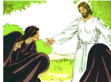
The resurrected Christ

9 That if thou shalt confess with thy mouth the Lord Jesus, and shalt believe in thine heart that God hath raised Him from the dead, thou shalt be saved.