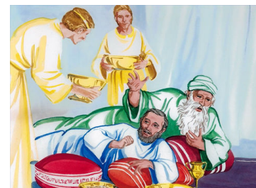
Lazarus at Abraham's side.