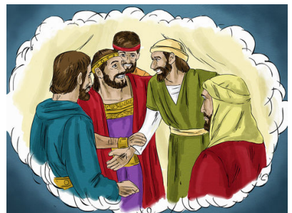
The rich man's brothers.