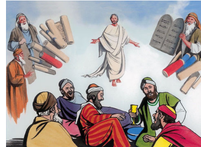
The Word of God was available to his brothers.

Answer: He said they have Moses and the prophets. In other words, they have the true and infallible Word of God.