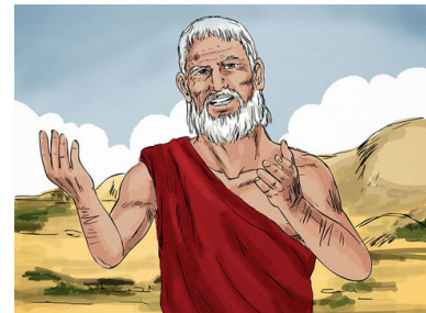
Abraham reminds the rich man.

Answer: Remember how you lived; and that there is a judgment, Hell, and endless separation.