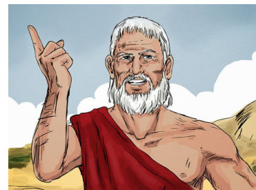
Abraham says 'they would not be persuaded'.

Answer: He said they would not be persuaded even though one rose from the dead.