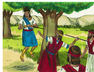
Joab kills Absalom

Amasa had been made Commander-in-Chief of David's armies because Joab had disobeyed his orders not to do violence to Absalom. Joab had disregarded the king's warning to "deal gently with the young man, Absalom, for my sake," as Joab was putting down a rebellion. Now, Amasa was in command. He had taken upon him the armor of Joab to pursue another revolter named Sheba.