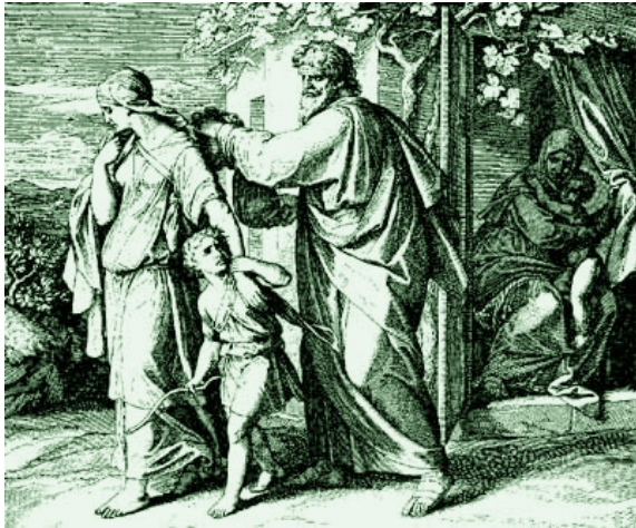
Hagar and Ishmael being

Taken off the milk diet is Paul's message in 1 Corinthians 3 and Peter's message in Peter 2:2 and Isaiah's in 28:9 : Whom shall he teach knowledge? and whom shall he make to understand doctrine? them that are weaned from the milk and drawn from the breasts.