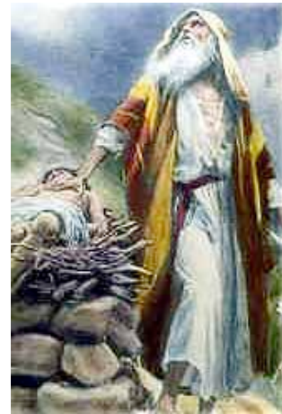
Abraham ready to sacrifice his son Isaac.

“Turn, O backsliding children, saith the LORD; for I am married unto you: and I will take you one of a city, and two of a family, and I will bring you to Zion:” (Jeremiah 3:14)