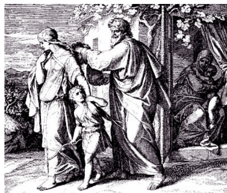
Hagar and Ishmael are sent away

10 Wherefore she said unto Abraham, Cast out this bondwoman and her son: for the son of this bondwoman shall not be heir with my son, even with Isaac. 11 And the thing was very grievous in Abraham's sight because of his son. 12 And God said unto Abraham, Let it not be grievous in thy sight because of the lad, and because of thy bondwoman; in all that Sarah hath said unto thee, hearken unto her voice; for in Isaac shall thy seed be called.