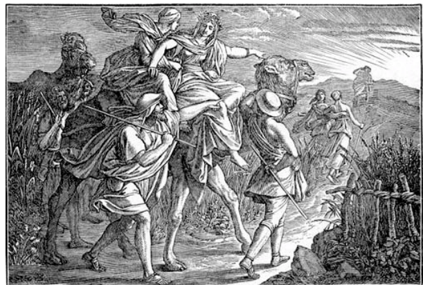
Rebekah sees Isaac coming to meet her

Romans 8:14 - “For as many as are led by the Spirit of God, they are the sons of God.”