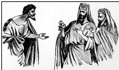
Judas betraying Jesus for 30 pieces of silver.

9 And Sarah saw the son of Hagar the Egyptian, which she had born unto Abraham, mocking. 10 Wherefore she said unto Abraham, Cast out this bondwoman and her son: for the son of this bondwoman shall not be heir with my son, even with Isaac.