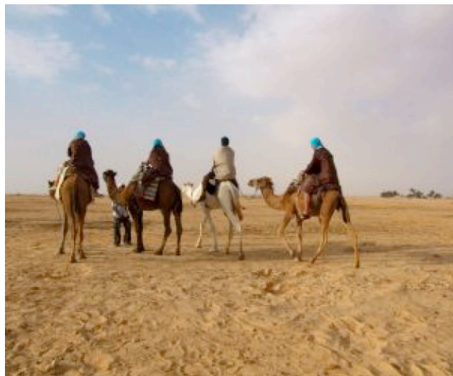
Abraham's servant bringing Rebekah to Isaac.

The servant realizes the journey has been long and painful but he tells her that through much tribulation we enter the kingdom. If we suffer, we shall also reign with Him: (2 Timothy 2:12a) Yea, and all that live godly in Christ Jesus must suffer persecution. (2 Timothy 3:12). And she had plenty, for there came false cults, inquiring of her the nature of her journey and for whom she was seeking. They laughed and scoffed at her going to meet him for whom her heart is longing. They said that it was Isaac who was supposed to meet her and make the journey to her home; that it is not good for a woman to run after a man. This is a type of the world -- calls us star gazers (Matthew 24) -- an unfaithful servant.