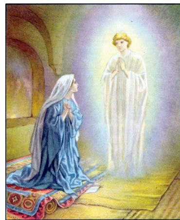
The angel appears to Mary.

30 And the angel said unto her, Fear not, Mary: for thou hast found favour with God. 31 And, behold, thou shalt conceive in thy womb, and bring forth a son, and shalt call his name JESUS. 32 He shall be great, and shall be called the Son of the Highest: and the Lord God shall give unto him the throne of his father David: 33 And he shall reign over the house of Jacob for ever; and of his kingdom there shall be no end.