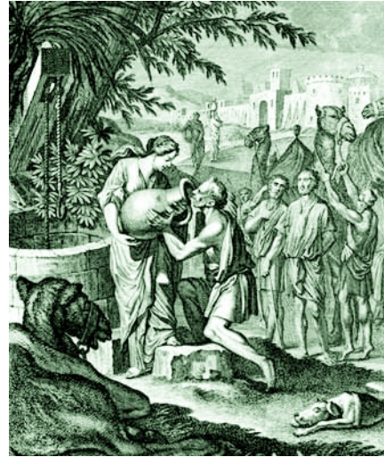
Rebecca giving Abraham's servant water.

Only empty pitchers may be filled, and thus were the pitchers of Rebekah. She came and provided water for all the servants' camels, little knowing that the time would come when she would no more go there and draw water that never quenches thirst entirely. The time has come when she will take of the Water of Life freely. This living water shall be a well of water springing up into life everlasting in her.