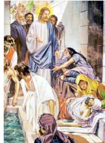
Jesus heals a man at the pool of Bethesda

She said, No man, Lord. And Jesus said unto her, Neither do I condemn thee: go, and sin no more.