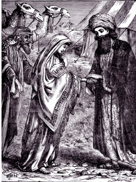
Rebekah Meets Isaac

“Just one glimpse of him in glory will the toils of life repay.”