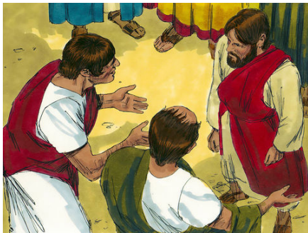
The centurion and Jesus.

Jesus spoke the Word, and the centurion's servant was healed.