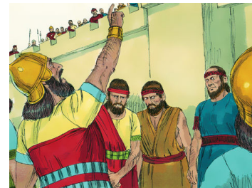
Rabshakeh shouting the demands of the king of Assyria.

5 I say, sayest thou, (but they are but vain words) I have counsel and strength for war: now on what dost thou trust, that thou rebellest against me?