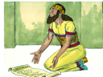
Hezekiah spreads the message in the Temple before the Lord.

20 Now therefore, O LORD our God, save us from his hand, that all the kingdoms of the earth may know that Thou art the LORD, even Thou only.