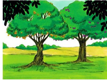
The Tree of Life and the Tree of the Knowledge of Good and Evil in the Garden of Eden.

d. In Genesis we have a preview of the Tree of Life, and in Revelation we have its relocation in the Holy City, the New Jerusalem.