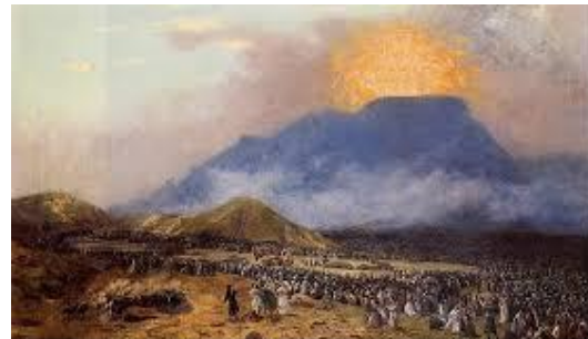
"The Israelites At Mount Sinai" By Jean-Léon Gérôme (1824-1904)

Exodus 3:12: And he said, “Certainly I will be with thee; and this shall be a token unto thee, that I have sent thee: When thou hast brought forth the people out of Egypt, ye shall serve God upon this mountain.”